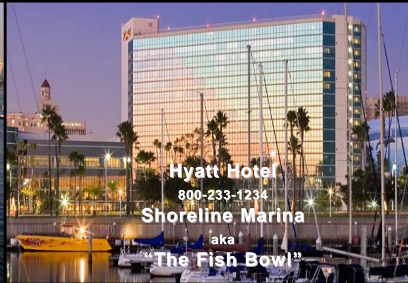
Hyatt Hotel 800-233-1234 Shoreline Marina aka "The Fish Bowl"