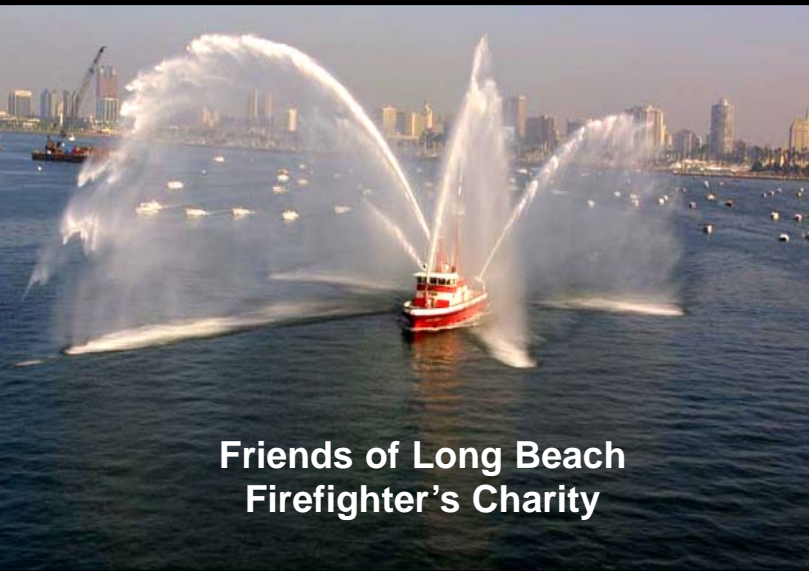
Friends of Long Beach Firefighter's Charity